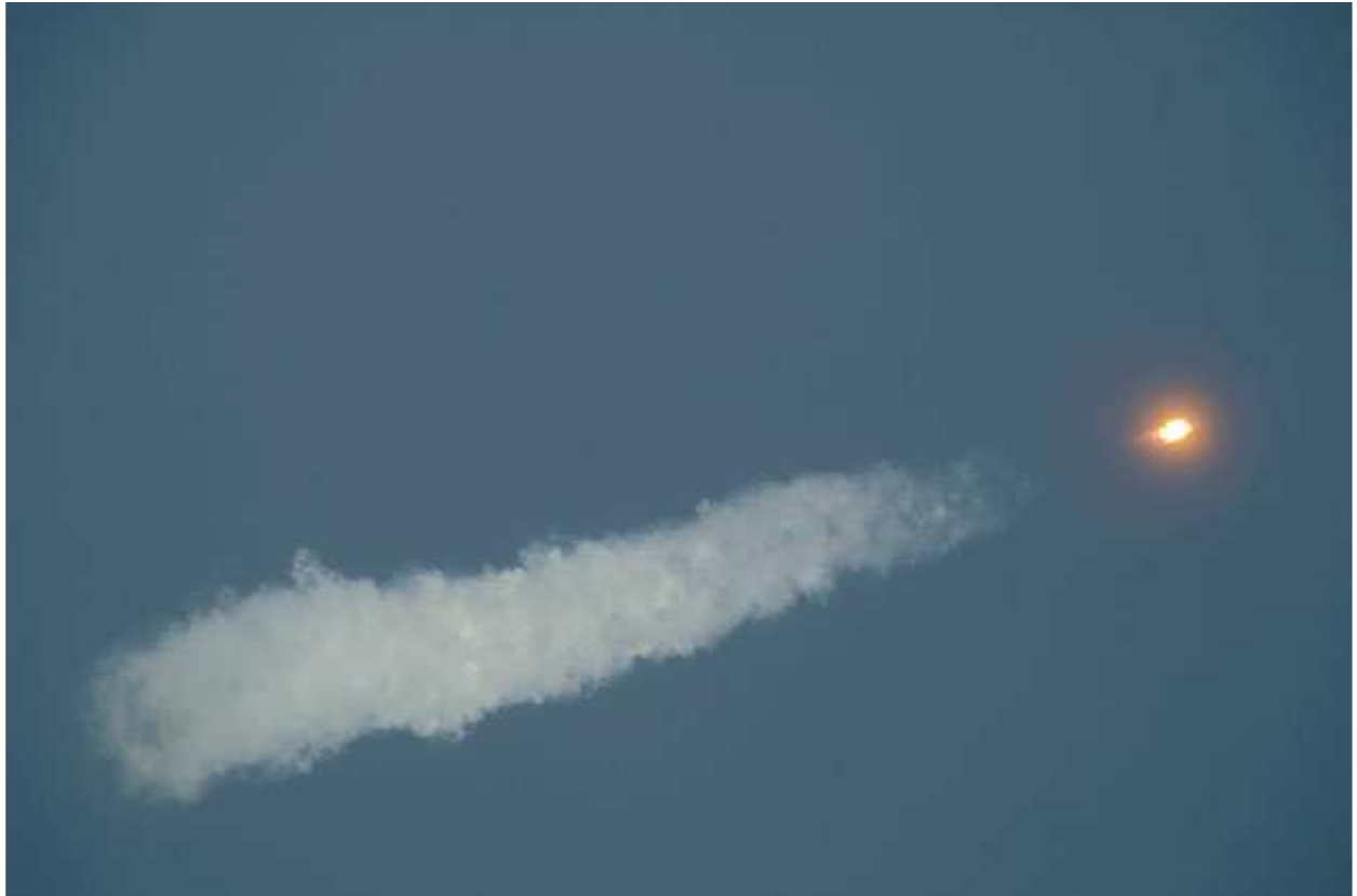
JSC2009-E-122461 --- The Soyuz TMA-15 launches from the Baikonur Cosmodrome in Kazakhstan on May 27, 2009.

"Wise and strong is he who leaves his heart open and searches without fear." –The Monna