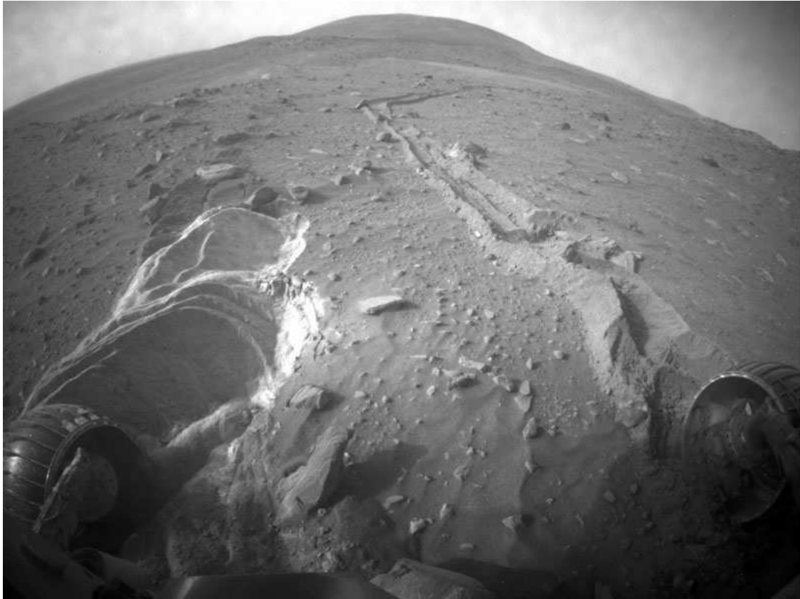
Spirit Encounters Soft Ground on Mars

Credit: Mars Exploration Rover Mission , JPL , NASA